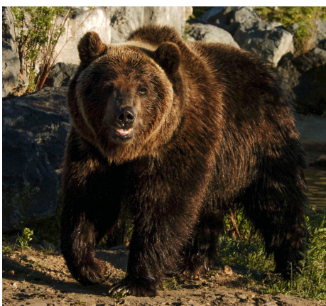
Bramble

P.S. I will keep in touch with those of you who have helped for as long as I am able.